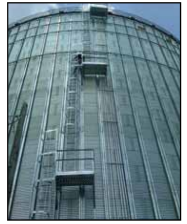
The BinMaster MVL eliminates the need to climb ladders to check levels.