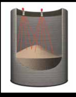
Adding an additional scanner in a wide bin provides more coverage of the material surface, ensuring greater accuracy!