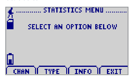
Statistics Menu Screen: Displays options available within the statistics menu