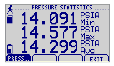
Channel Statistics: Displays statistics