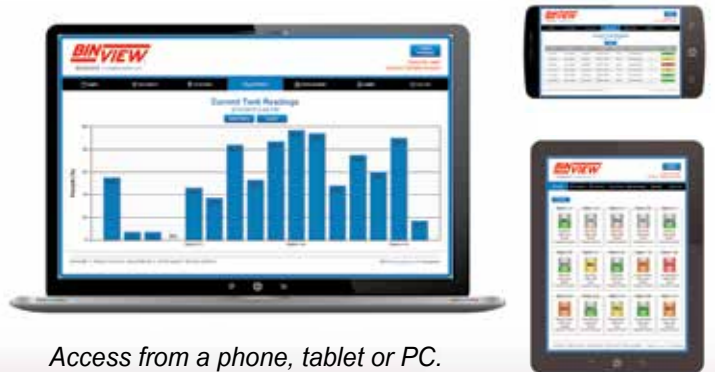
Access from a phone, tablet or PC.

and is accessible from any device with a connection to the internet. Real-time inventory management and automated alerts can be accessed from a Smartphone, tablet or PC. BinView offers both security and control over your assets and users of the application. Super users can have the ability to set up and manage locations, gateways, and vessels, while other users may have view-only or receive alerts-only privileges. The system can be set up so that some users have access to all sites, while others may only be able to access data for a single location.