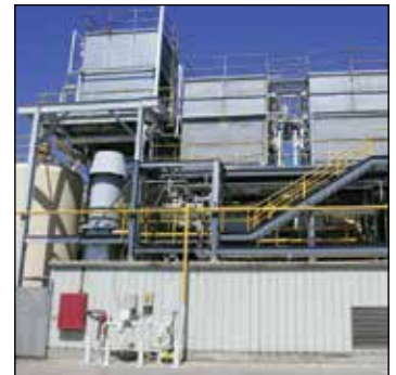
Square or rectangular tanks pose no challenge.