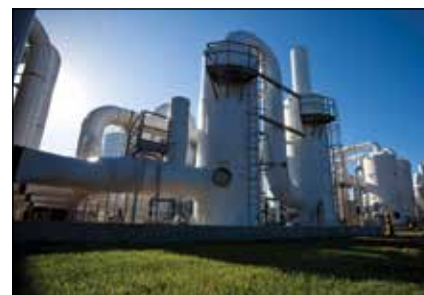
Ultrasonic is often used in chemical processing plants.

SmartSonic sensors are designed to adapt to the internal tank conditions, automatically adjusting power and receiver sensitivity to any distance and reflecting surface. This technology ensures the same echo is maintained over the entire operating range which enhances measurement accuracy. The net benefit is the SmartSonic ultrasonic sensor has a low incidence of false echoes, which are common among competitive ultrasonic products. The SmartSonic beam is very uniform and automatically controlled in the advanced electronics of the sensor design, allowing the sensor to perform where some competitive ultrasonic devices have failed.