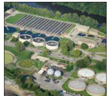
Water treatment facilities utilize SmartSonic.