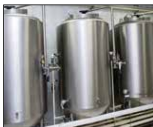
Measuring liquids in food processing tanks.