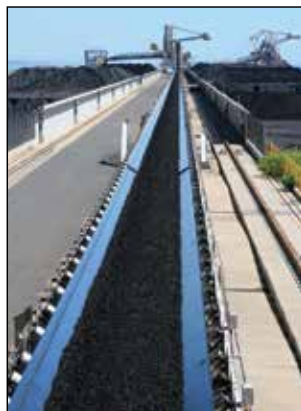
SmartSonic can be installed on belt conveyors.