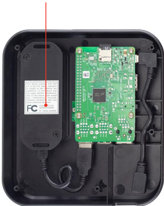
1a. Wireless Transceiver